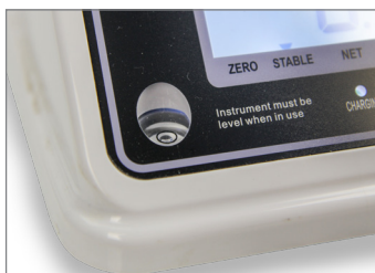
Level bubble to ensure ↗ scale is level