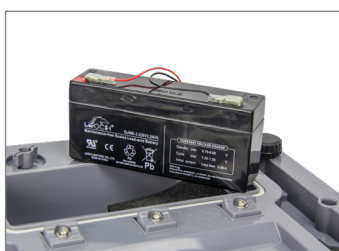
Internal rechargeable ↗ battery