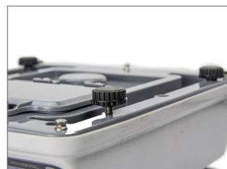
Adjustable feet on ↗ each corner of base