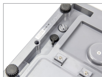
Water resistant membrane ↗ on power input